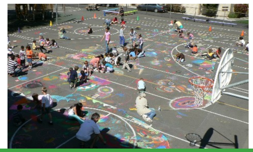
Our <u>Chalk Art Project</u>. Practicing for a place in the Guinness Book of World Records