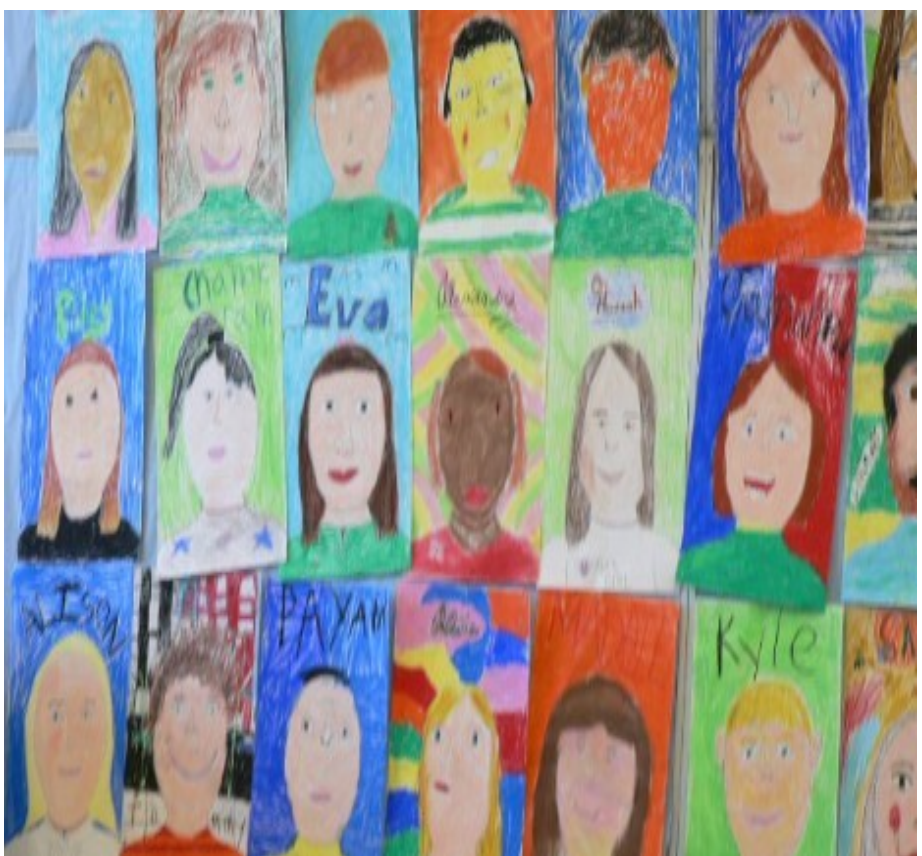
PTA Sponsored <u>Young</u> <u>Imaginations</u> Assemblies